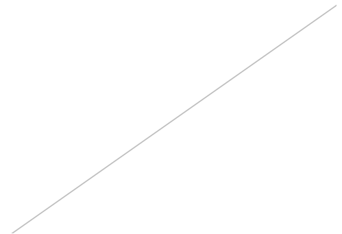
S&P/TSX Composite Index - Sectors Returns